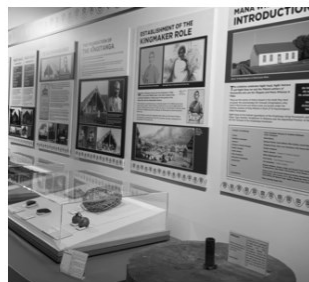
Mana Whenua o Piako