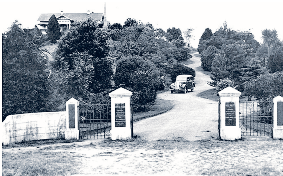
Howie Park Gates in the 1930's